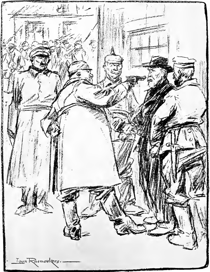
“An Offer of Employment.”